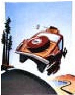
Let's go on a road trip!