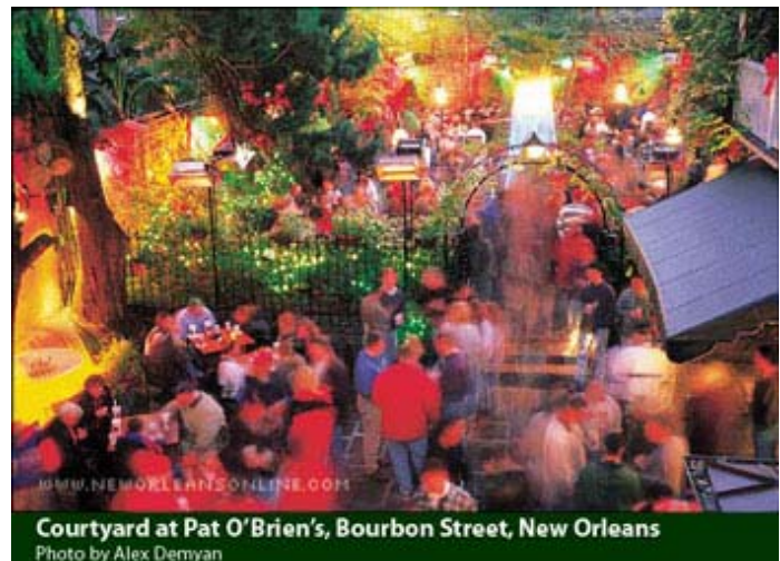
Courtyard at Pat O'Brien's, Bourbon Street, New Orleans